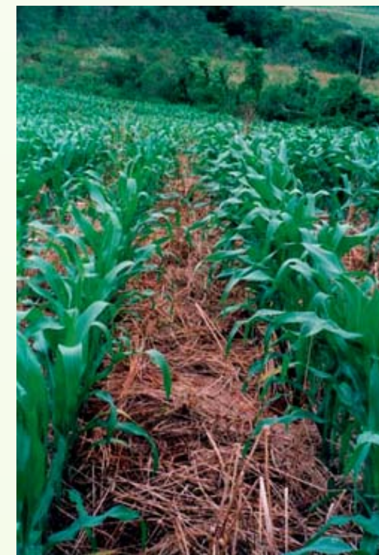
Figure 3: No-Till Maize (Photo

Participants make their decision in each round and see the outcomes - their earnings, everyone else's earnings, and ecosystem service provision. We suggest you pay a few participants based on their earnings!