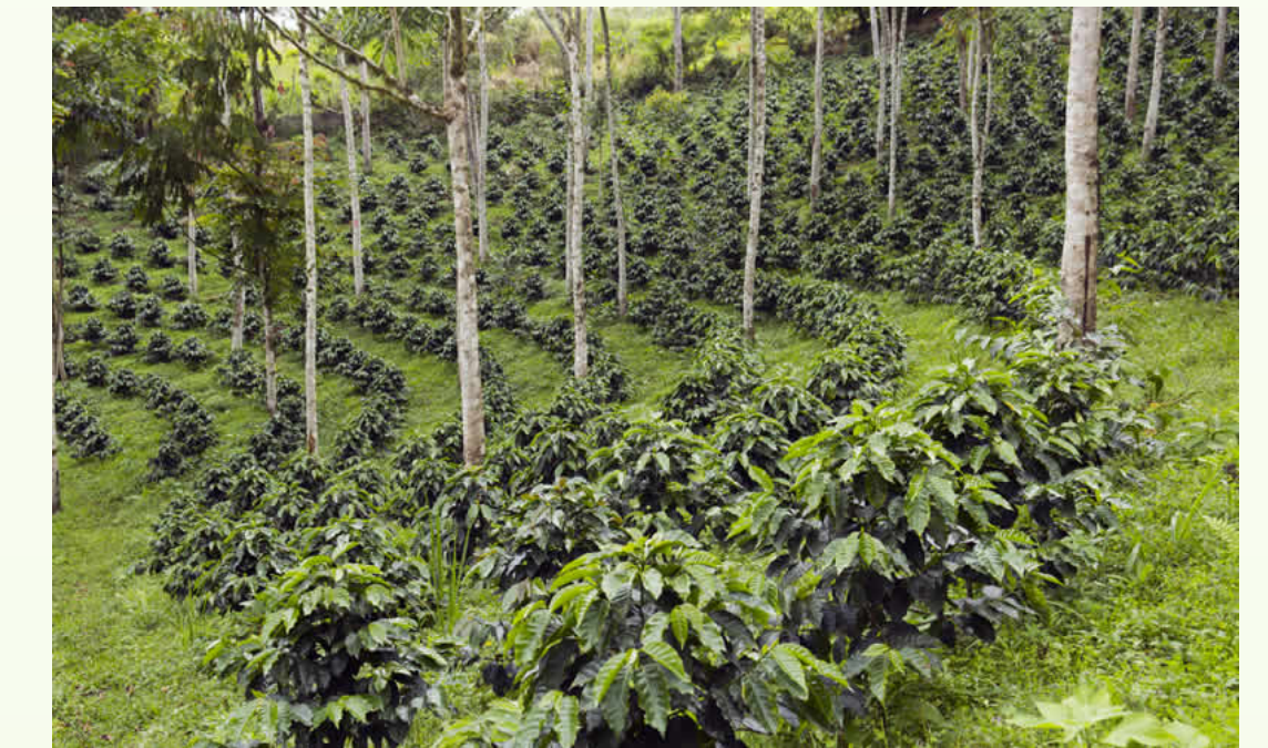
Figure 5: Agroforestry

We make it easy for you to play the game and tune it to your interests, and fun for your participants!