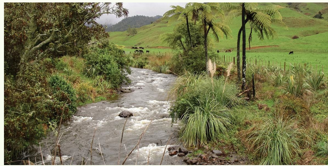
Figure 1: A Riparian Buffer Strip

The game is fun and immersive! It takes 50 mins to 2 hours to complete, and works best with 10-60 participants. No background knowledge is required , but different groups (from undergrads to grad students to policymakers) will get different things from the exercise.