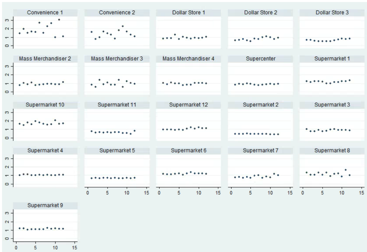
Figure 2: Store-Level Price Indexes

Figure 2 shows store-level price indexes ( StorePriceIndex_6 ) for each store ( j=21 ), spanning the twelve months in 2012 (horizontal axis) and the corresponding value for the price index (vertical axis).