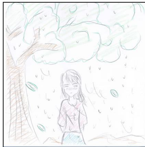
Figure 4a: Hopelessness, 85th percentile