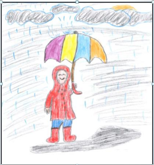
Figure 3b: Self-Efficacy, 94th percentile