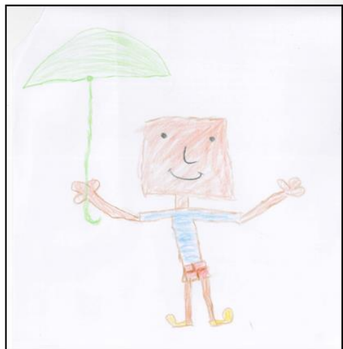
Figure 4b: Hopelessness, 7th percentile