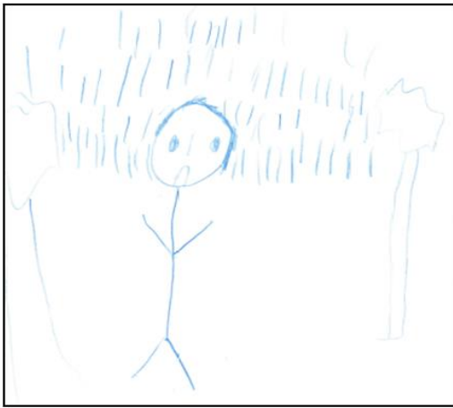
Figure 2a: Happiness, 17th percentile