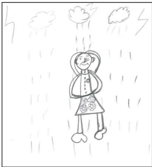
Figure 3a: Self-Efficacy, 8th percentile