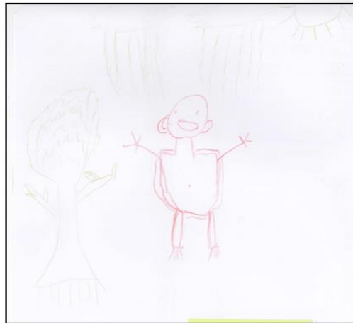
Figure 2b: Happiness, 92nd percentile